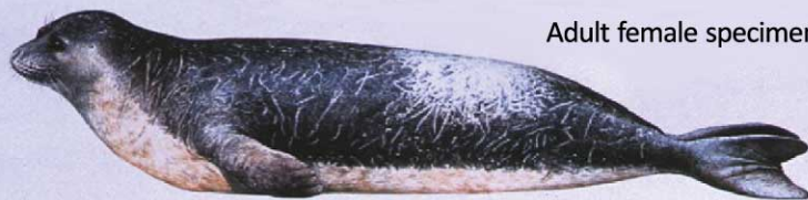
Adult female specimen