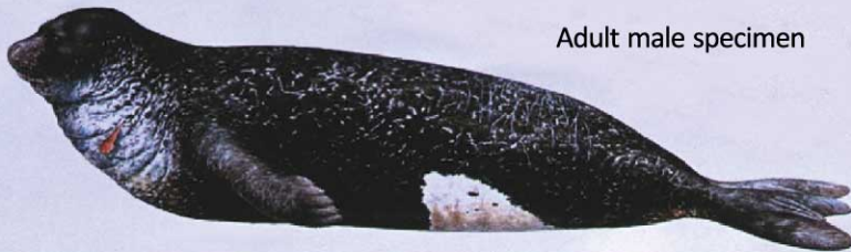
Adult male specimen